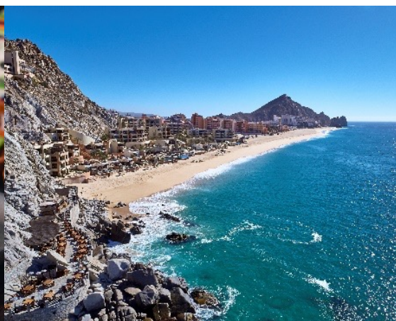
IMPACT THE DESTINATION

Triple the impact of your event with this offer. Your event hotel will offset your event's carbon emissions, make a donation in your group's honor to a local community non-profit and you will select a signature F&B, entertainment or wellness experience for your attendees.